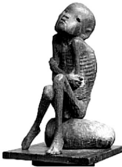
Figure 3. “Resigned,” 1971, by Antonio Pujía. Private Collection, Sydney, Australia. Photograph by courtesy of Antonio Pujía.

...a culture of the difference has arisen: the minority values and perspectives, until now ignored [...] we are in front of the loss of the dominant speech. [...] This crisis questions and reveals the system of binary