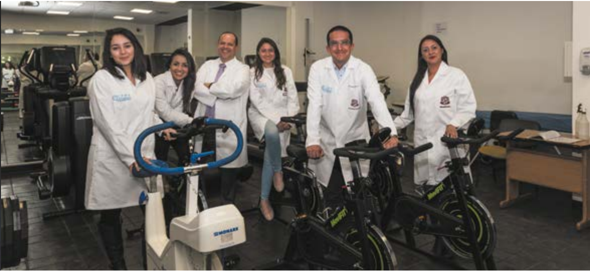
← The group focuses on physical activity and explores its beneficial effects in other areas such as physical condition, thought processes, self-esteem, and other aspects of physical and mental health.