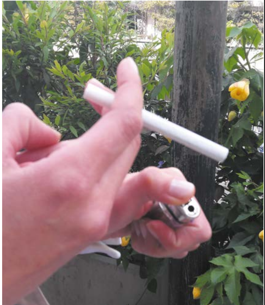
↑ Experience shows that the most economically effective way to reduce the consumption of tobacco is to increase its cost by imposing taxes.

The general objective of this research is to better understand the impact of prices and packaging on cigarette consumption and on health equity in middle-income countries. The idea is to generate information about how higher taxes on tobacco translate into changed behavior on the part of vulnerable populations, taking into account the regulatory context.